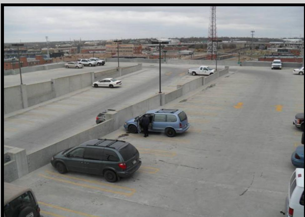
10 years later top level of garage

For More Information On Our Products and Services Visit www.strongwall.com